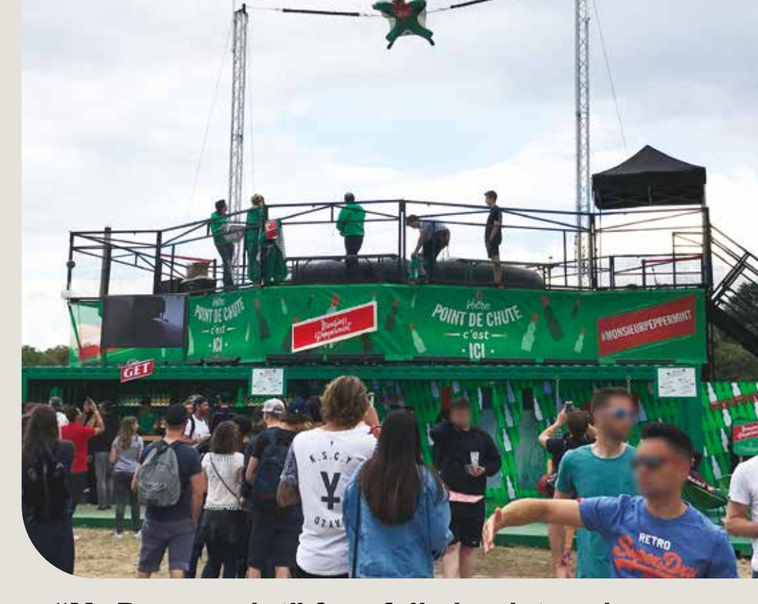
"Mr Peppermint" free-fall simulator above a Get 27 bar, 2017 Lollapalooza-Paris Festival